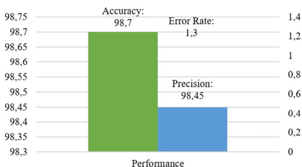
Fig. 3. Performance prediction analysis for the proposed proximity detection framework.

Table III presents a collective report to determine the evaluation of the results. Figure 3 shows the overall comparison of Accuracy, Precision, and Error rate.