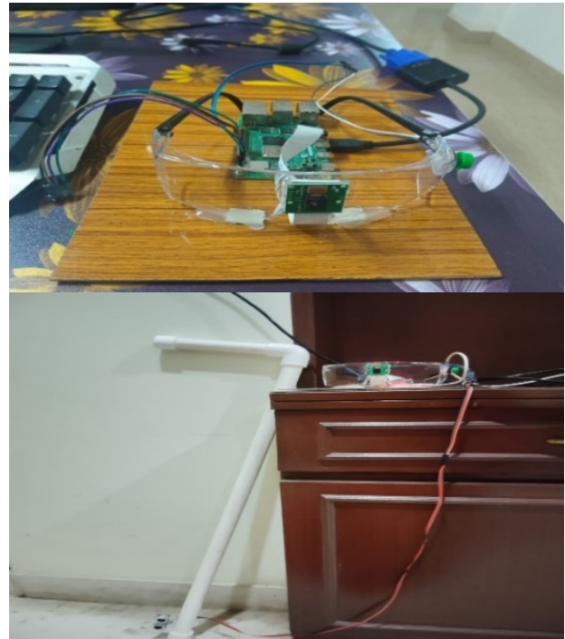
Fig.2. Implementation of the HPDVI model with a Picamera for Raspberry Pi kit and ultrasonic sensor on a white walking stick.

Ultrasonic sensors are preferable to infrared sensors because they are not affected by moisture or black materials. In general, using ultrasounds to detect nearby objects can help people with visual impairments feel more confident and safer while moving around. Figure 2 presents the overall implementation and setup of the entire HPDVI model.